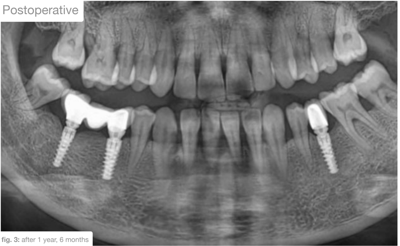
fig. 3: after 1 year, 6 months