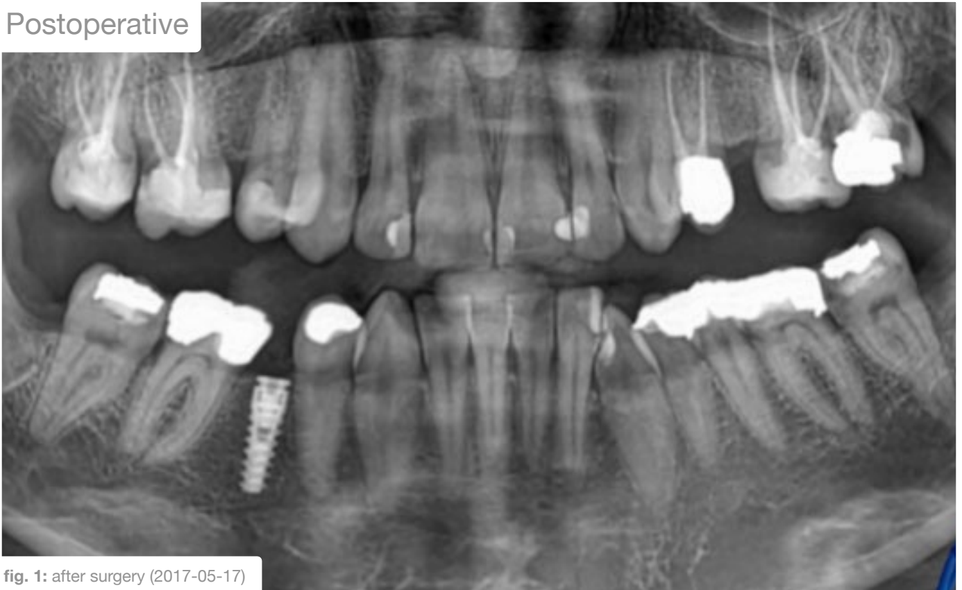
fig. 1: after surgery (2017-05-17)