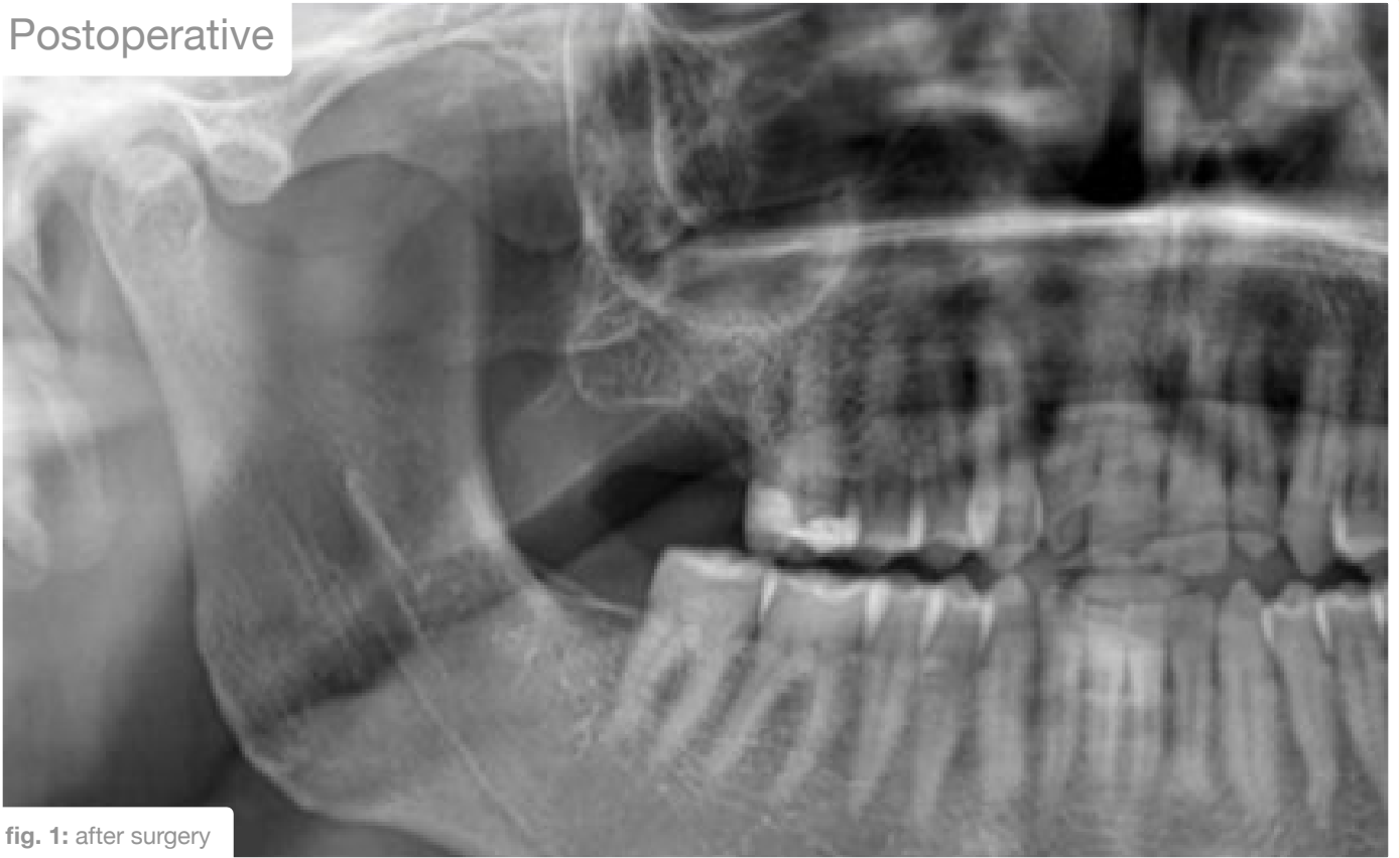
fig. 1: after surgery