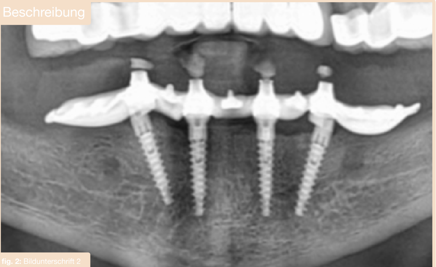
fig. 2: Bildunterschrift 2