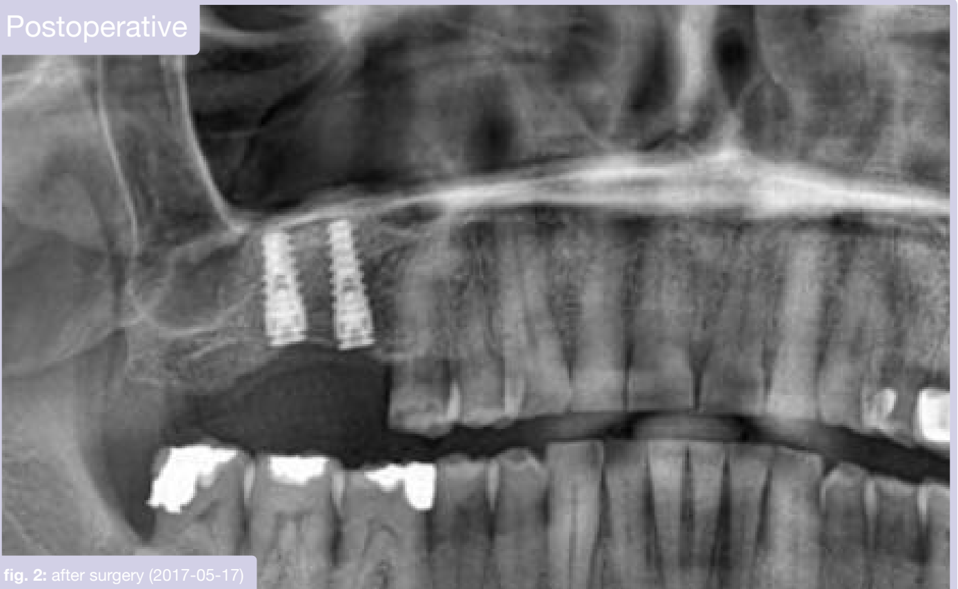
fig. 2: after surgery (2017-05-17)