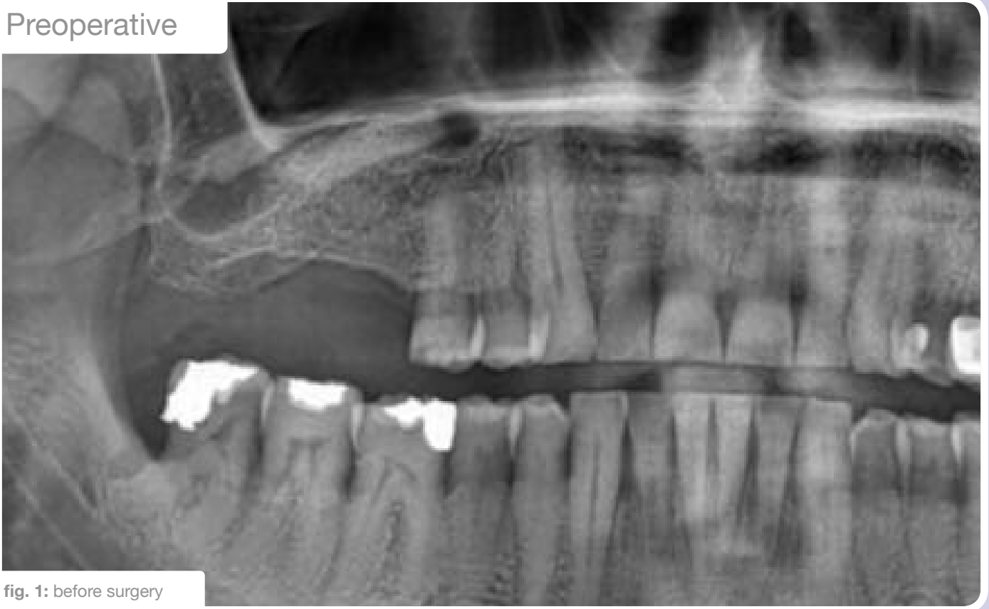
fig. 1: before surgery