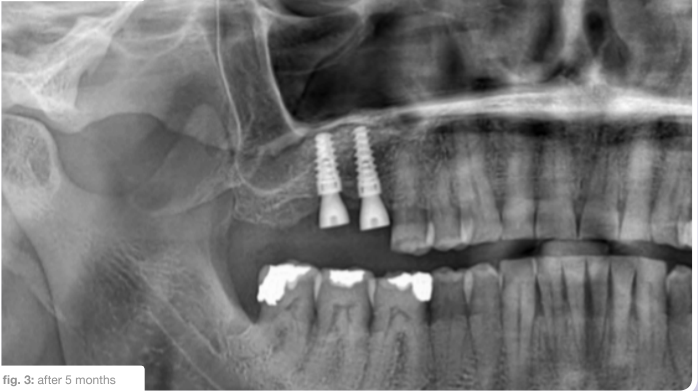
fig. 3: after 5 months